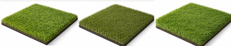
Budget £10/sqm Premier £15/sqm Luxury £25/sqm